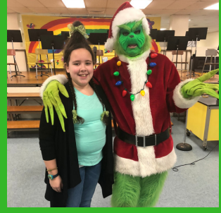
The Grinch's visit to North Elementary