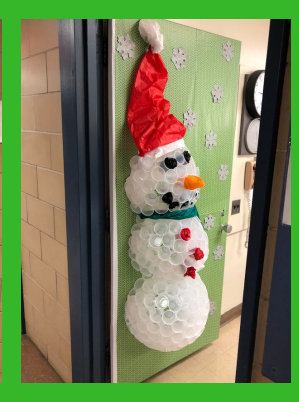
At Chace Street School.